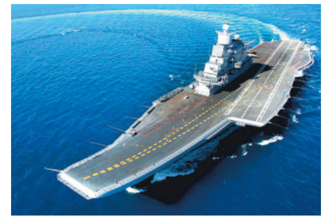
INS Vikramaditya, India's only aircraft carrier, which would be joined this month by the newly built INS Viraat

IAC-2 would be imposing enough on the basis of its integral air power alone. But, in fact, IAC-